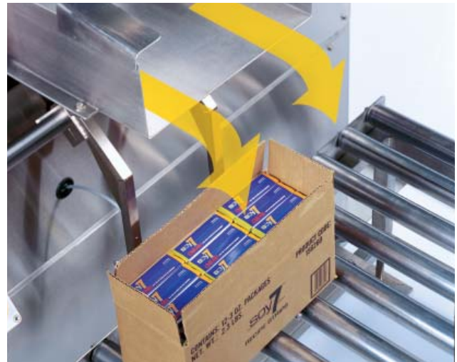
Loaded case is pneumatically lowered for discharge