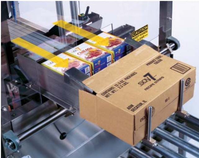
Product is automatically collated and loaded into the case