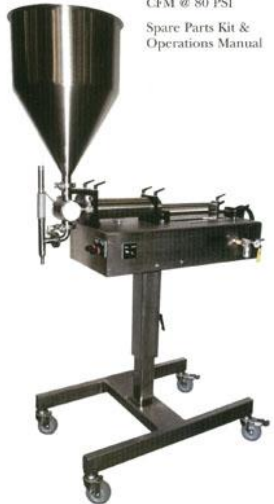
PEDESTAL MOUNTED MACHINE WITH OPTIONAL POSITIVE CUT-OFF NOZZLE

T: 972-385-9456 F: 972-596-3619 wagnerpkg@verizon.net / www.wagnerpkg.org